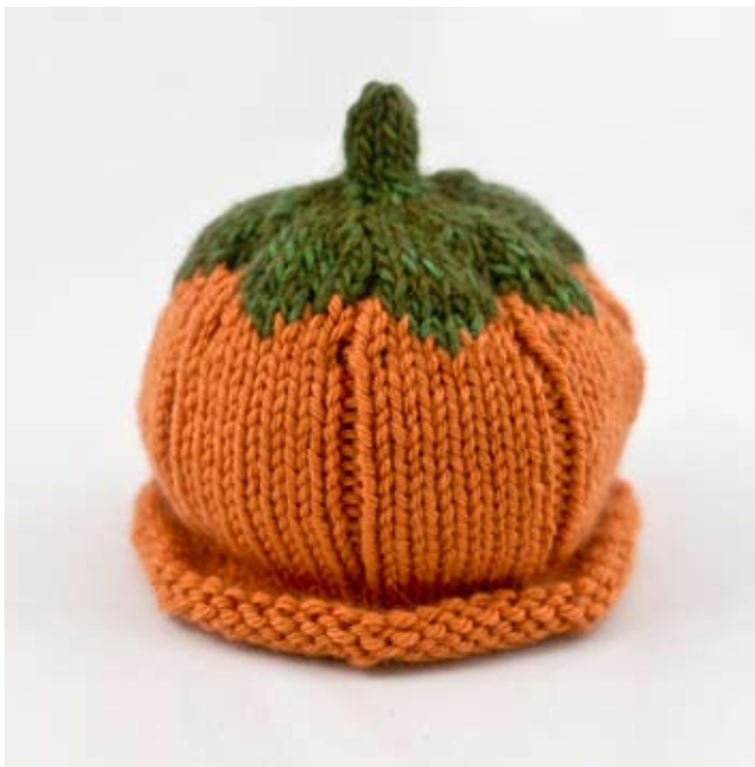
CREATED BY: LISA EDELSTEIN, HOUSE

Baby caps are a simple and effective tool that can keep babies warm and ultimately contribute to reducing newborn deaths in the developing world.